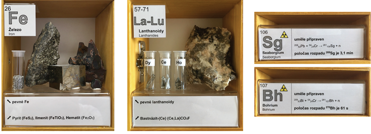
a) elemental and nature forms

One of physical properties, which is often governed by periodicity, is boiling (or melting) point. However, several factors affect the boiling and melting points of substances. In the case of gaseous and liquid nonmetals, London dispersion forces (dependent on the