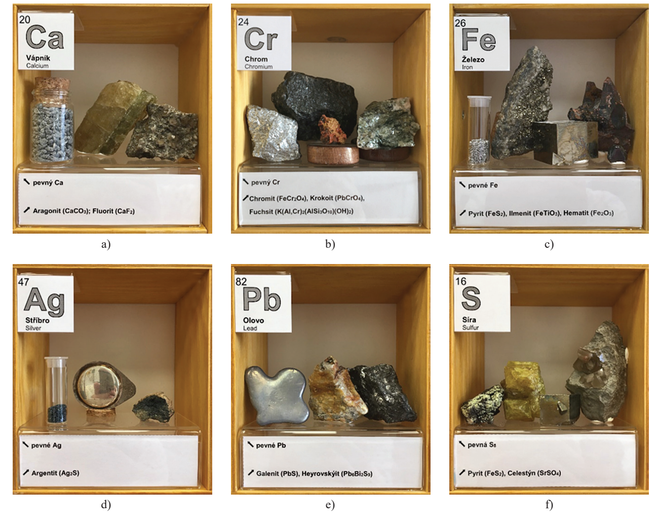
Figure 2. Examples of sample sets demonstrating the change of bonding preferences going from the left to right side of the periodic table – the compartments of: a) Ca with Aragonite (CaCO<sub>3</sub>) and Fluorite (CaF<sub>2</sub>); b) Cr with Chromite (FeCr<sub>2</sub>O<sub>4</sub>), Fuchsite (K(Al,Cr)<sub>2</sub>(AlSi<sub>3</sub>O<sub>10</sub>)(OH)<sub>2</sub>) and Crocoite (PbCrO<sub>4</sub>); c) Fe with Pyrite (FeS<sub>2</sub>), Ilmenite (FeTiO<sub>3</sub>) and Hematite (Fe<sub>2</sub>O<sub>3</sub>); d) Ag with Aragonite (Ag<sub>2</sub>S); e) Pb with Galenite (PbS) and Heyrovskyite (Pb<sub>6</sub>Bi<sub>2</sub>S<sub>9</sub>); f) S with nature elemental sulphur, Pyrite (FeS<sub>2</sub>) and Celestine (SrSO<sub>4</sub>).

The mineral composition of the Earth crust can serve as a natural textbook of the bonding preferences of the elements based on the hard and soft Lewis